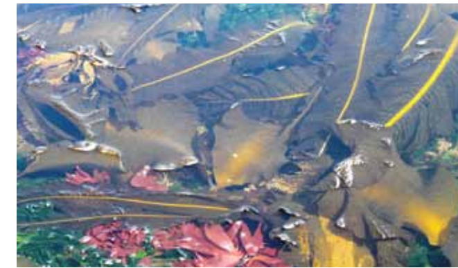
Seaweeds in a tide pool in the Bay of Fundy, New Brunswick, Canada. The kelps are already farmed and others are candidates for future aquaculture development.

Although often called "marine plants," not all seaweeds are plants. The most used and cultivated, the brown seaweeds, now belong to the Chromista kingdom. If green and red seaweeds can