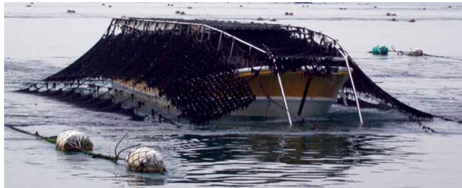
When harvesting nori, specialized boats go under the nets. The red seaweed Porphyra yezoensis is processed into wrappers for sushi rolls and nutritious snacks.