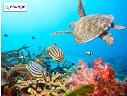
Fish and sea turtle near a coral reef.