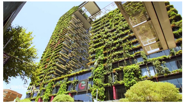
Fig. 2 Iconic Sydney Central Park multifunctional building, which boasts many smart living features ( https://www.wsp.com/en-AU/projects/central-park )