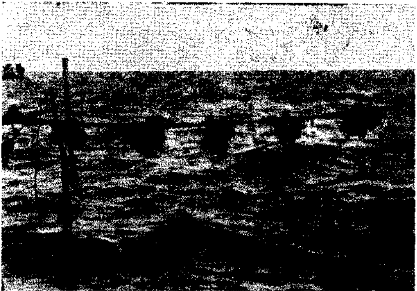
30 days growth of G. edulis in long line coir rope.