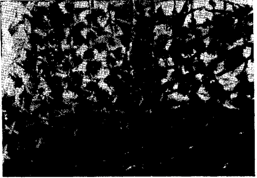
30 days growth of G. edulis in 2 x 2 m size coir rope net

coir ropes after first harvest were allowed to grow further and second harvest was made after another 60 days growth. A part of the harvested material was again utilised as seed material for culture and it also attained harvestable size in 60 days growth. The maximum yield of crop obtained from these experiments was 7.0 fold