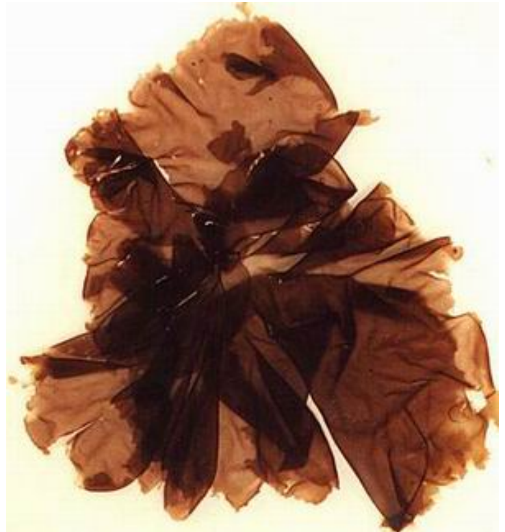
Porphyra tenera :