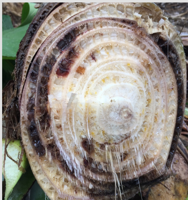
Figure 3. Panama disease affects bananas and is caused by the soil borne fungus Fusarium oxysporum f. sp. cubense

In order to manage the globally developing epidemic, both short and long-term actions need to be taken. In the short term, current exclusion/control methods have to be scrutinized, as the spread of TR4, also within plantations, overwhelmingly demonstrates their inaccuracy and low efficacy. Reliable and standardized tools and protocols for the detection and management of Foc are urgently required, e.g. the use of fungicides and biological crop protection agents / methods. Long(er) term solutions, however, should include: scrutinizing recommended alternatives for the 'Cavendish' clones and, foremost, highly technologically driven and commercially oriented professional breeding programs should eventually diversify the current market with a variety of new banana cultivars that meet consumer preferences and break-up the conservatism of monoculture. Technology, however, has to engage with society and the environment in multidisciplinary approaches for a sustainable future of the banana and its producers.