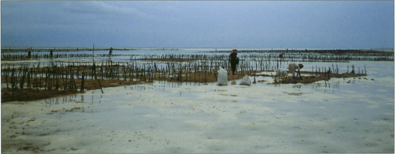
Features and shape of an algae farm. Proprietorship of one farm does not indicate that adjacent farms are controlled by the same or to her related farmers. Rather, the distribution of farms indicate the overall and fast growth of the activity which means that a farmer may have farms at many different localities within the cultivated area.

tiated three pilot farms in 1983/84: one in Fumba on Zanzibar island, one on Pemba and one at Kigombe, close to Tanga on the Tanzanian mainland coast. The farming activities focused on indigenous Eucheuma cottonii and E. spinosum , but both attempts failed after some time.