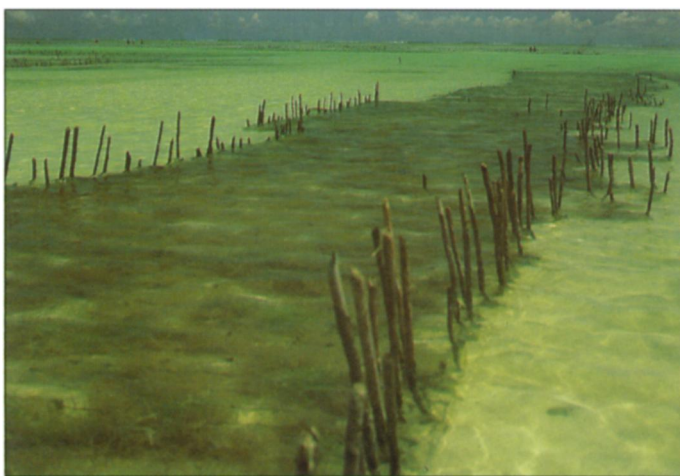
The spatial organization of algae farms outside the village of Paje. Space for productive alga farms has become scarce.

The development of algae farming in Zanzibar has a prehistory of algae culling, but commercial algae farming was not practiced until 1989. From 1989 onwards, the activity grew at an enormous rate both in terms of farming sites and in number of farmers. By 1991, it is estimated that around 10 000 people were directly involved in algae production and three to four times more than that number were more or less engaged, in not less than 19 different localities (2).