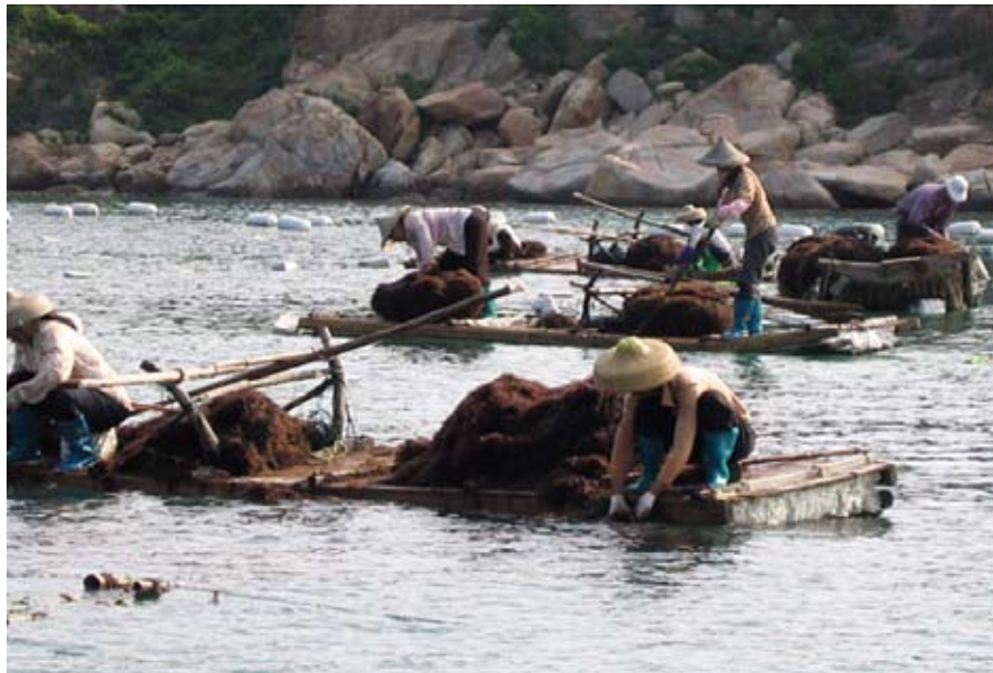
Gracilaria seaweed is effective at removing inorganic nutrients from water.