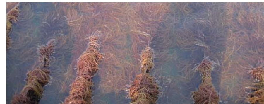
Gracilaria cultivation can help control harmful algae blooms.

The results showed that Gracilaria can suppress growth and decrease densities of these microalgae. Large-scale cultivation of Gracilaria may be an effective ecological strategy to control harmful algal blooms in Chinese coastal waters.